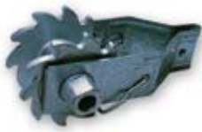
EASY TO USE RATCHET SYSTEM

The In-Line Tensioner is an easy to use ratchet system that makes tensioning on Spur®, PolyPlus®/PolyStrand®, White Lightning® and Hot-Site® quick and easy.