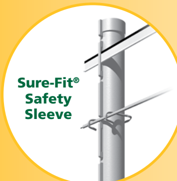
Sure-Fit® Safety Sleeve

Unique T-sleeves convert a metal T-post into an HTP® post that is much safer and more attractive. Durable and impact resistant. Available in white or black.