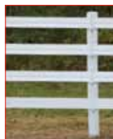
Ocala pg. 19