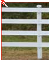
Lexington pg. 19